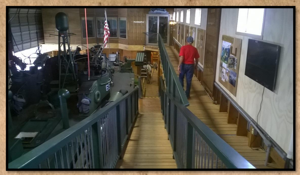
Bob strolling along the timeline, you figure out which Bob

Donations to the museum don't just include grants. Artifacts, maps, and books are also given over to the facility. The most recent is a souvenir pillow case from the U.S. Navy's Sampson, New York training station with a PT boat on it. Pillow cases such as this were often given to a sailor's sweetheart, wife, or mother during WWII. The United States Naval Training Station in Sampson, New York facility was established initially by the United States Navy in 1942. The Navy obtained 2,600 acres of former farmland and also vineyards for the base on the east side of Lake Seneca, New York. Along with the training station, a 1500-bed hospital was constructed. The mission of USNTS Sampson was basic training for large numbers of new recruits. During the war, over 411,000 recruits were trained at the station. With the end of the war, USNTS Sampson was closed. The Station was used by the state of New York as a temporary college for 15,000 GI Bill students in July 1946. The museum has two other pillow cases which are included as part of the card game table set up on the museum's floor. They also include images of PT boats.