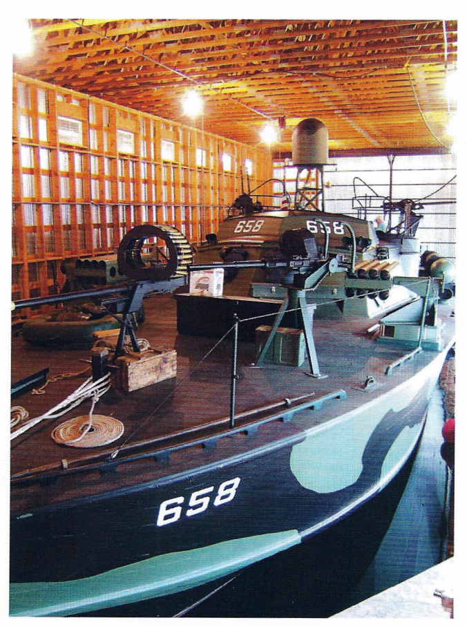
PT 658 is berthed at the Swan Island Naval Reserve Station.

After getting a chance to look at the outside of the vessel we went aboard where we went around on the deck, down into the crew and officer quarters then back up topside and down into the engine compartment. In this small space there