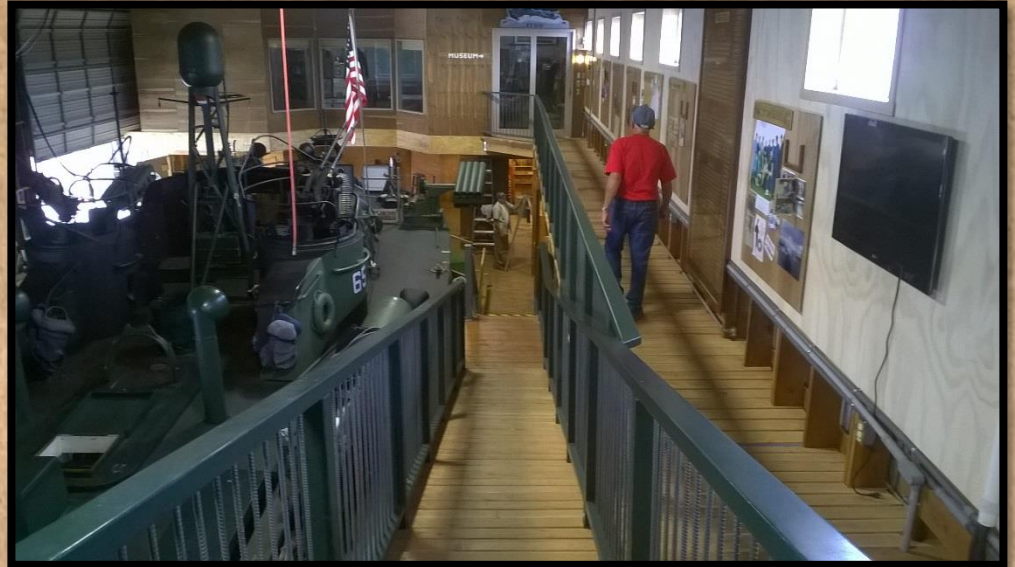
Bob strolling along the timeline, you figure out which Bob

Donations to the museum don't just include grants. Artifacts, maps, and books are also given over to the facility. The most recent is a souvenir pillow case from the U.S. Navy's Sampson, New York training station with a PT boat on it. Pillow cases such as this were often given to a sailor's sweetheart, wife, or mother during WWII. The United States Naval Training Station in Sampson, New York facility was established initially by the United States Navy in 1942. The Navy obtained 2,600 acres of former farmland and also vineyards for the base on the east side of Lake Seneca, New York. Along with the training station, a 1500-bed hospital was constructed. The mission of USNTS Sampson was basic training for large numbers of new recruits. During the war, over 411,000 recruits were trained at the station. With the end of the war, USNTS Sampson was closed. The Station was used by the state of New York as a temporary college for 15,000 GI Bill students in July 1946. The museum has two other pillow cases which are included as part of the card game table set up on the museum's floor. They also include images of PT boats.